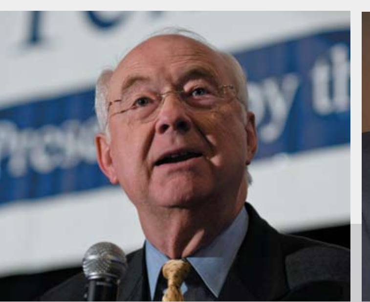
◦ Former U.S. Senator Phil Gramm gives introductory remarks at the Foundation's Policy Orientation for the Texas Legislature event in Austin.