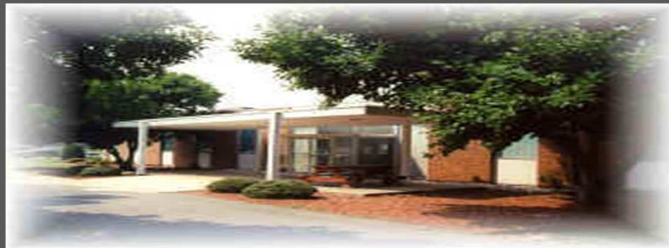
Day Reporting Center, Dover, DE