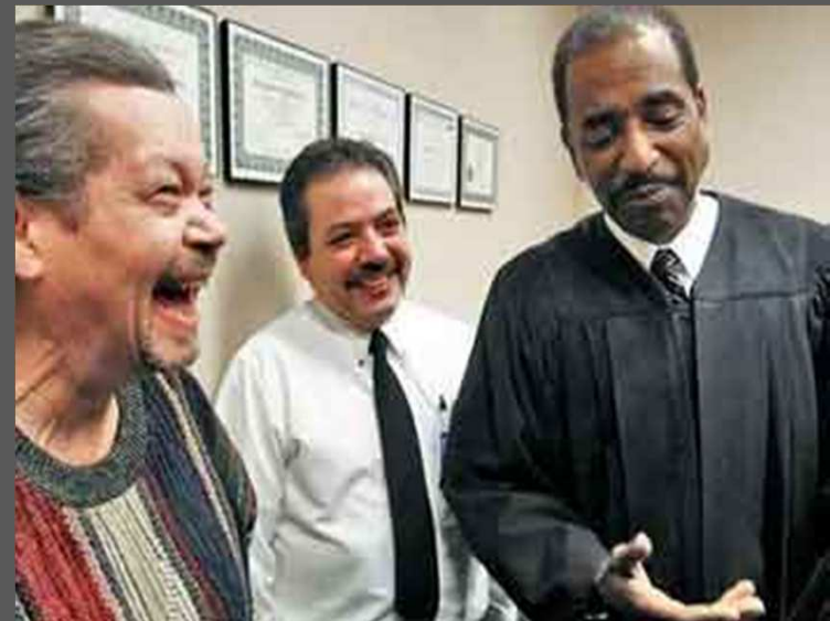
Buffalo, N.Y. Veterans' Court