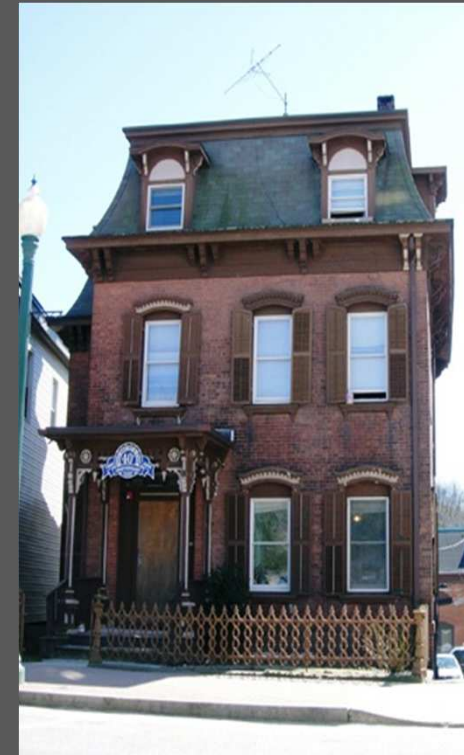
Norwich, CT. Halfway House