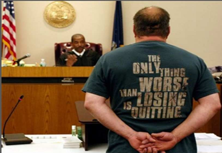
Buffalo, N.Y. Veterans' Court