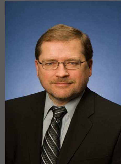
Grover Norquist, President, Americans for Tax Reform