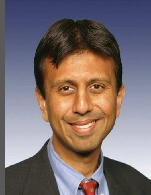
Gov. Bobby Jindal