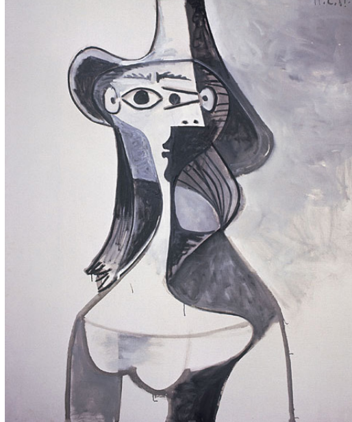
Value is in the eye of the beholder.

The reason people fall for the labor theory of value is that market prices in the real world really do seem to go hand in hand with how much effort is needed to produce something. A hand-stitched afghan is more expensive than a blanket mass-produced in a factory. But what’s really happening is that consumers subjectively value the hand-made items more than the goods cranked out of an assembly line (because of delicate workmanship, the novelty, etc.), and in order to induce laborers to spend the time making them, the final price is bid up to a relatively high level. At the same time, if it were not possible to get a higher payment for the hand-stitched afghan, craftspeople may not be willing to produce them by hand. Again, confronted by a scarcity of hand-stitched