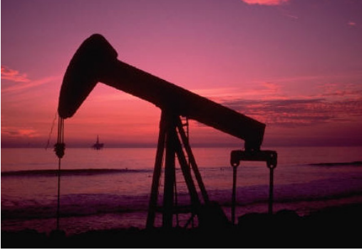
Oil didn't make land more valuable until people began to place more value on oil.

For example, if a superstitious culture erroneously believes that mandrake root possesses medicinal properties, then the root might command a very high price in the marketplace, even though it's not "really" valuable. On the other hand, land containing vast reservoirs of crude oil would have been relatively cheap in 1800, because people at that time didn't realize the uses to which oil would be put in the 20th century. Had they known, even back then the land's price would have been bid up. These two illustrations make clear that it is the expectations and actions of the consumers and producers that set market prices. Any "objective" condition can only influence prices indirectly when someone grasps the situation and alters his behavior accordingly.