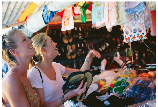
Voluntary trade benefits everyone by allowing all parties to a transaction to be better off.

In other words, it is perfectly logical for Joe to consider the orange more valuable than the apple, and yet for Maria to believe the exact opposite. (Note that this wouldn't be possible for characteristics such as height or color; if both people thought the other's fruit were heavier, one of them would simply be mistaken.) That is why voluntary trade is so beneficial for humans: it allows people with "reverse valuations" to swap goods so that everyone is happier with the new arrangement compared to the original distribution of property.