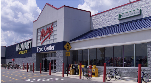
Price floors reduce the competitive forces that lower prices on consumer goods.

teenager has never held a job before and has no skills, he or she might be worth only $3 an hour when first hired—and willing to work at that price as well. By insisting that this worker be paid more than double that (when you consider Social Security and other compliance costs beyond just the paycheck), the employer will quite obviously decide to skip over this worker. And thus the minimum wage law keeps the most vulnerable workers from getting their foot in the door and becoming more productive.