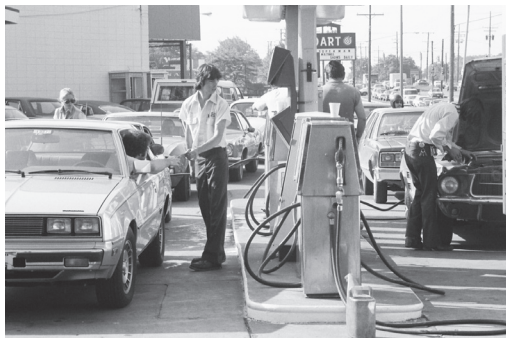
Some people blamed OPEC, but the long gasoline lines of the 1970s were caused by U.S. price controls.

Another example of a price ceiling is rent control in major cities. Here the government tries to help lower-income tenants by placing legal maximums on what their supposedly greedy landlords can charge. The consequence? There are long waiting lists to get into the coveted apartment units. “Slumlords” can stay in business, even though they don’t fix the water heater or put on a new coat of paint every season. Since the government artificially