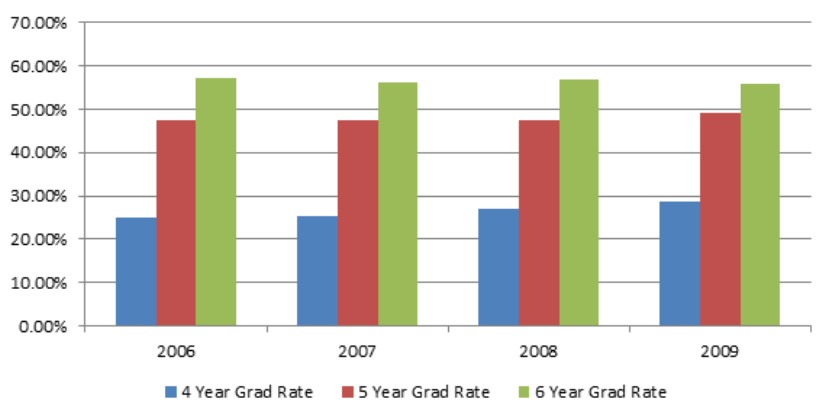
Chart 1. Texas statewide graduation rates 2006-2009: four, five, and six years

Approximately 57 percent of first-time students who sought a bachelor's degree, or its equivalent, and enrolled at a four-year institution full time in the fall of 2002, completed their degree within six years. By